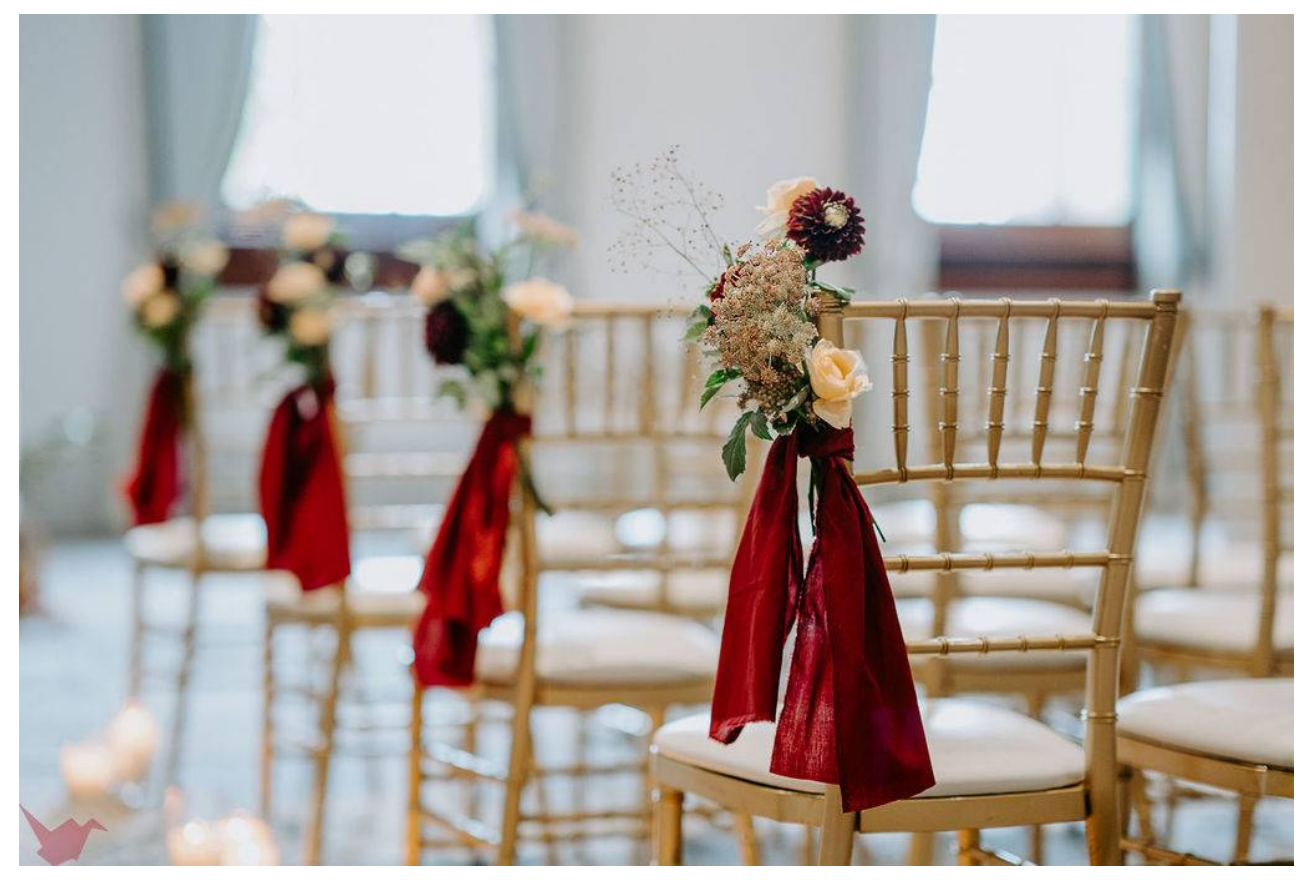
Paper Cranes Photography