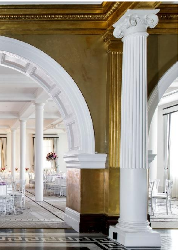
The Treasury Room

Heralded as the hotel's largest wedding space, the James Cook Ballroom is the ultimate arena for couples looking to throw a grand affair. Sure to inspire the most luxe receptions, the James Cook Ballroom is fitted with state-of-the-art multi-coloured lighting, cutting-edge visual and audio technology, and has ample space for seamless all-night celebration.